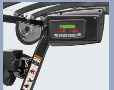
Easy to see display