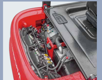
Easy for maintenance