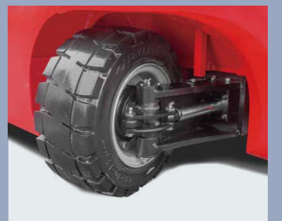
Smaller turning radius