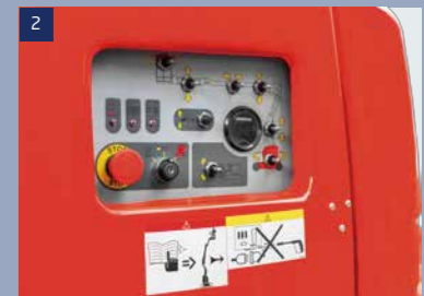
Base control box: the control box can be used to control each action of the device, easy to understand