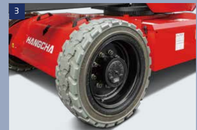
Tires: foam-filled tires with good off-road performance