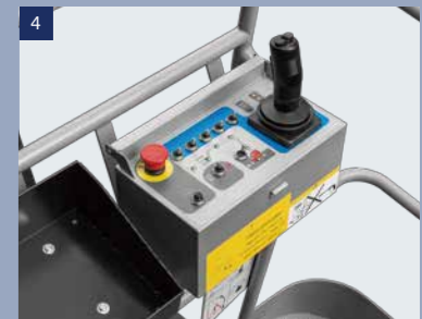
Basket control box: each action of the device can be controlled through the control box to quickly reach the working area, and the control is simple and easy to understand