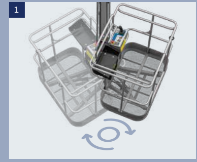
Basket: can be rotated left and right at an Angle of 140°