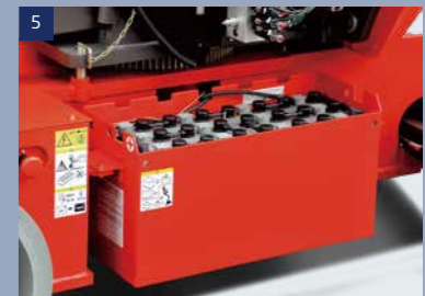
Standard tracking battery: Reduce 40% of the charge time, raise 50% of the life time