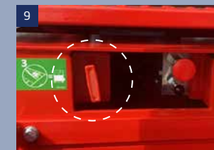
9 Manual lowering valve: When the operation system failed or the battery power is too low to let the platform decline, we can use this valve to lower the machine