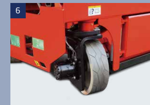
6 Traction motor