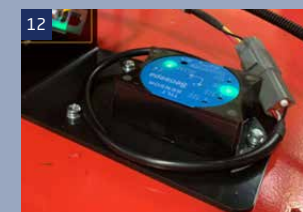
12 Angle sensor: when it is lifting and walking on the slope, the sensor will automatically judge the status of the machine, if the angle is larger than the rated angle, it will alarm to remind the operator.