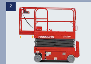
2 Extension platform