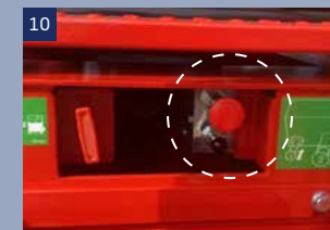
10 Manual release valve: When the machine can not move, you can push the machine after pressing this valve